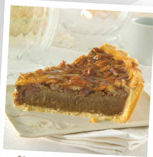
BOURBON STREET PECAN PIE