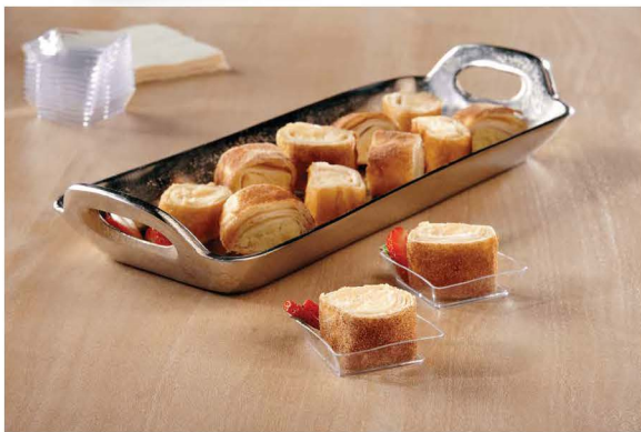
XANGOS® CUT INTO 6 PORTIONS