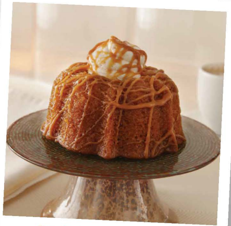
PUMPKIN SPICE BUNDT