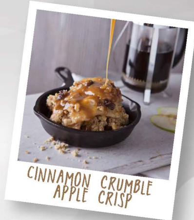
CINNAMON CRUMBLE APPLE CRISP