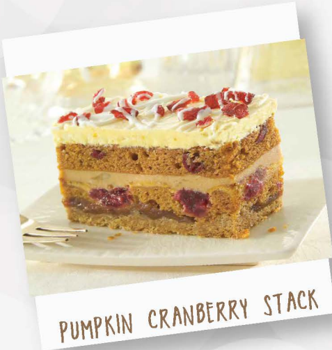
PUMPKIN CRANBERRY STACK

SEASONAL. LTO's excite guests with new, seasonal offerings and generate incremental sales. A great way to celebrate the season or to try a new dessert item for your menu.