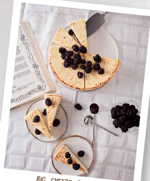
BIG CHEESE BRULEE