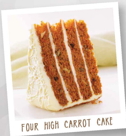
FOUR HIGH CARROT CAKE

FINE DINING. Tempt your guests with photographs that tantalize, mouthwatering descriptions that sell and desserts that will please them all. Don't forget about our free Design Suite menu program, to support your marketing efforts.