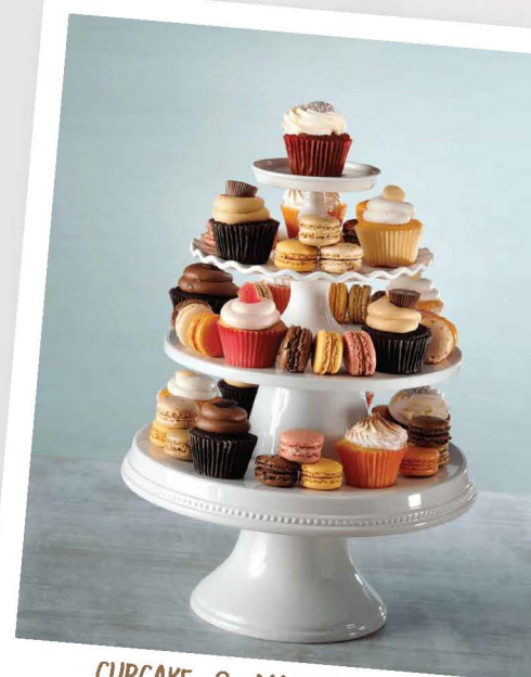
CUPCAKE & MACAROON TREE