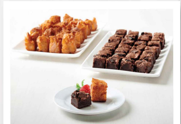
VANILLA CRISPY BREAD PUDDIN' BITES & BROWNIE BITES