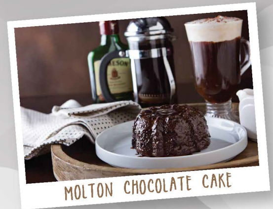
MOLTON CHOCOLATE CAKE