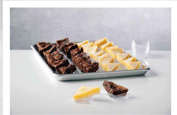
FABULOUS CHOCOLATE CHUCK BROWNIES & LUSCIOUS LEMON SQUARES