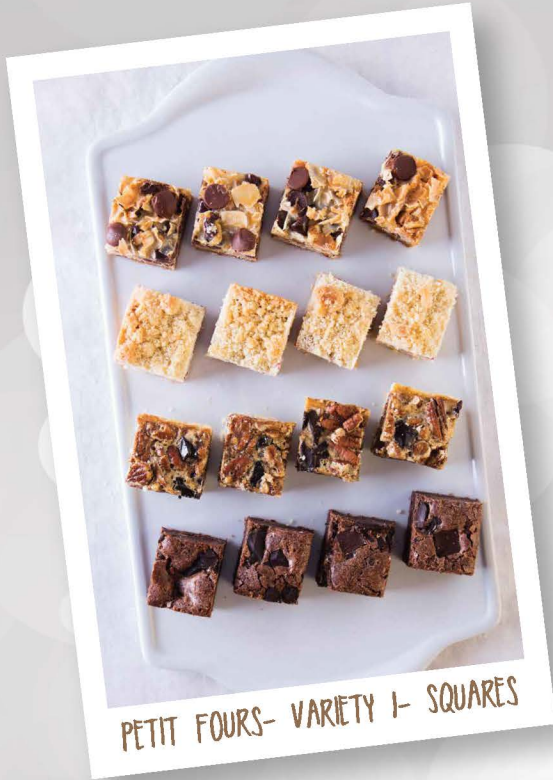
PETIT FOURS- VARIETY 1- SQUARES

BUFFETS. Don't forget to fill your buffet with decadence. From bars and bites to Xangos®, our unsliced products provide versatility so portioning and costs are in your control.