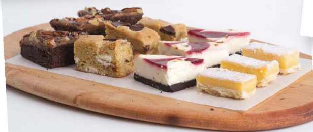
PERFECT PETIT FOURS VARIETY 1