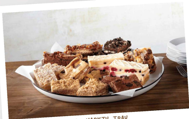
EZ8 VARIETY TRAY

BANQUET/CATERING. Simply thaw, create and serve. Create your own variety trays, tailored to each occasion or event. One variety, so many options.