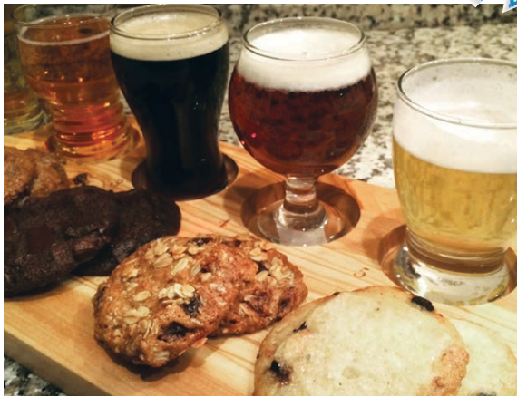
left to right: Sandy's Amazing Choc Chunk, Just Choc, Oatmeal Raisin, Lemon Blueberry