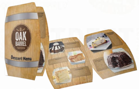
Beer Barrel Folded Menus