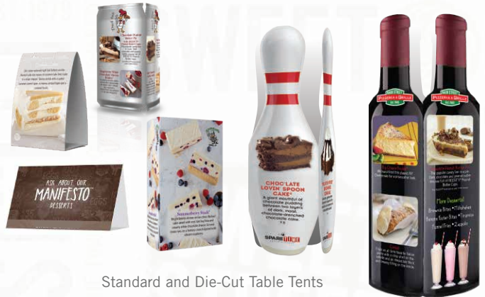
Standard and Die-Cut Table Tents